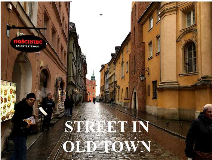
STREET IN OLD TOWN