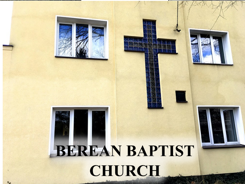
BEREAN BAPTIST CHURCH