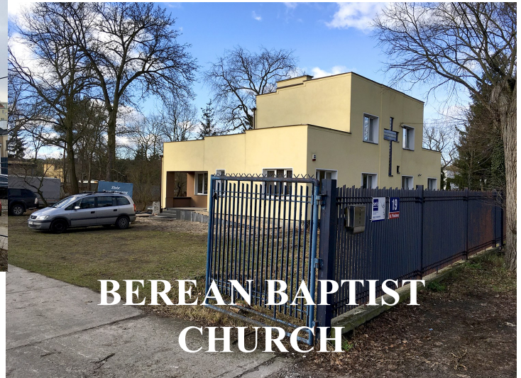
BEREAN BAPTIST CHURCH