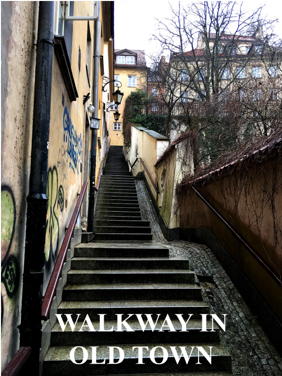
WALKWAY IN OLD TOWN