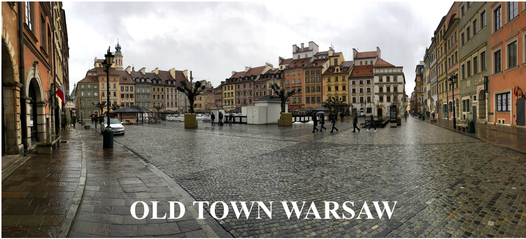
OLD TOWN WARSAW