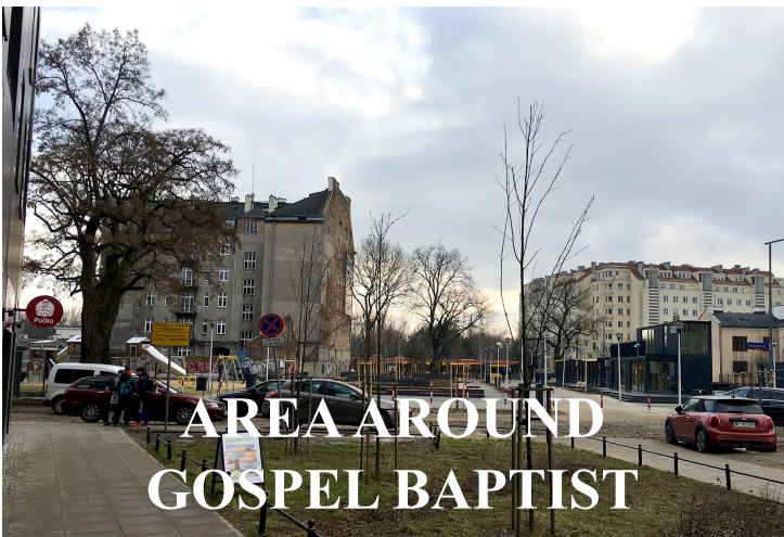
AREA AROUND GOSPEL BAPTIST