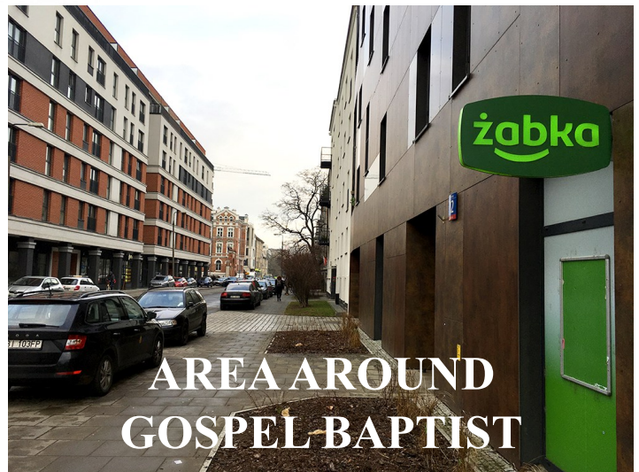
AREA AROUND GOSPEL BAPTIST