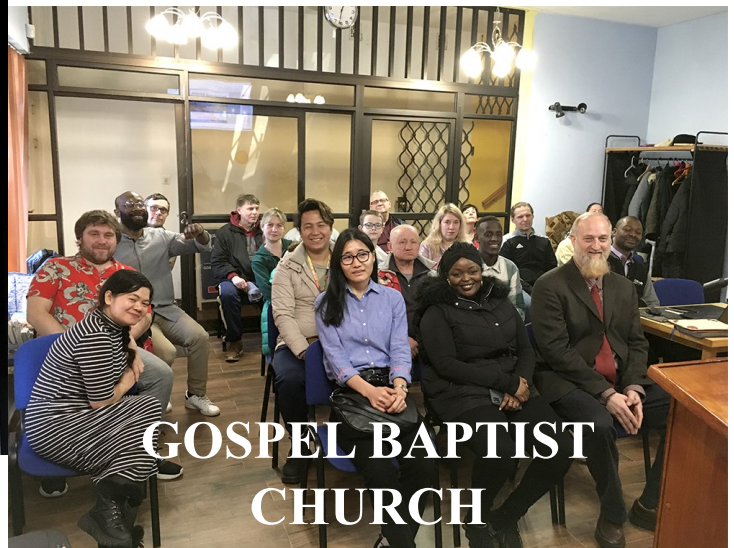
GOSPEL BAPTIST CHURCH